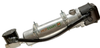
WL Model with thermostat