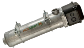
WL Model without thermostat